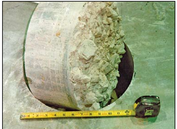
Figure 2: Subgrade restraint has been the focus of concern in the past