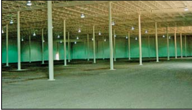
Figure 1: A perfect world – an industrial shell building ready for slab installation

It is important to frame any design discussion with the acknowledgment that ACI considers slabs on ground as non-structural. Slabs on ground are generally modeled as an elastic slab supported by a field of linear springs. Stresses from applied loads can be calculated using this or similar models. Slab on ground design should result in sufficient